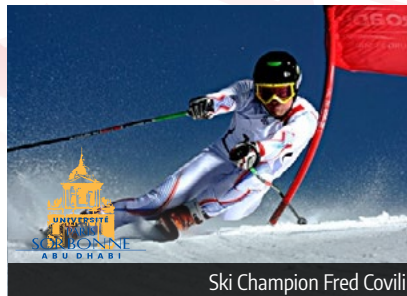
Ski Champion Fred Covili