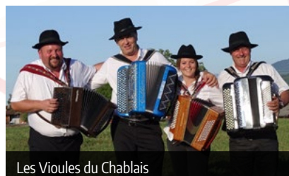
Les Vioules du Chablais